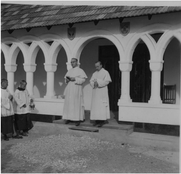
Vader Sneekers during holy communion.