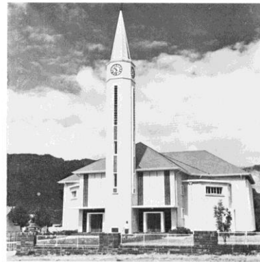
N.G. Sendingkerk, Ceres