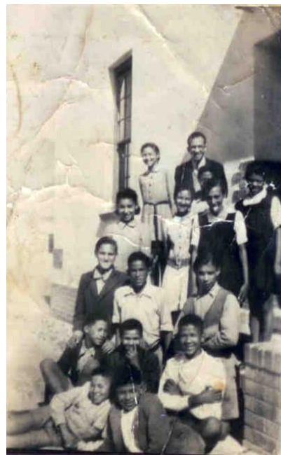
Klas van 1946