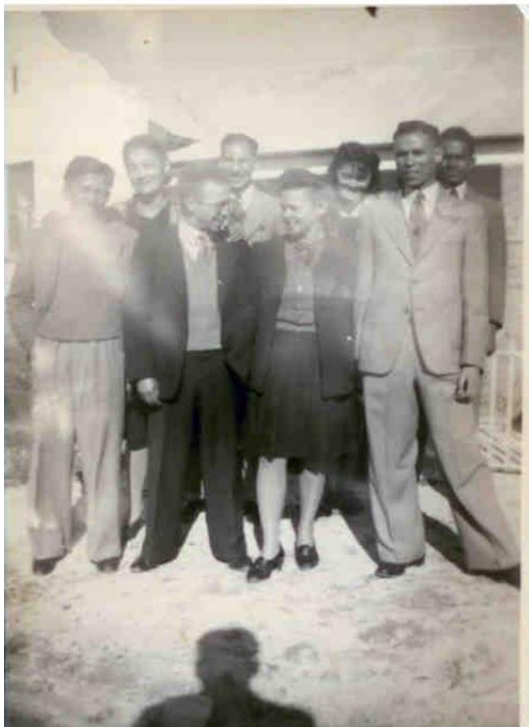
Eerste Onderwysersgroep in 1945